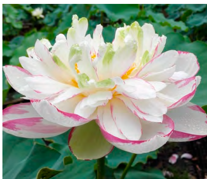
Figure 3. Lotus cultivar with spotted color flower.