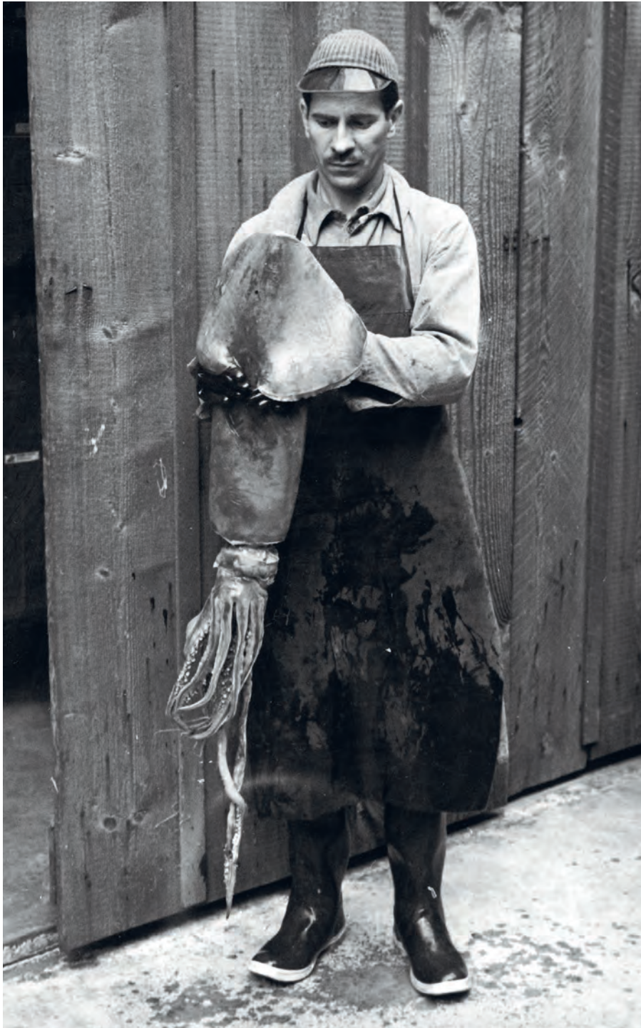
Marine biologist Ed Ricketts holding a Humboldt squid outside his laboratory in Monterey, California.