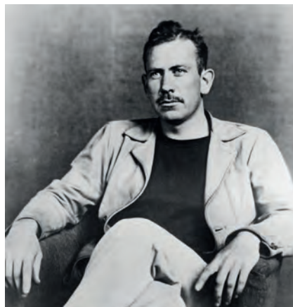
An expedition by John Steinbeck and Ricketts formed the core of their book Sea of Cortez .

where a flood tide’s waves barely splash over his shoes. And the first creatures we encounter there are the ones we really would notice: the familiar things, such as periwinkles, and the teeming ones, like rock lice. Only then are our eyes directed to the rarer animals, culminating in a special reward for our sustained attention: the giant owl limpet, Lottia gigantea .